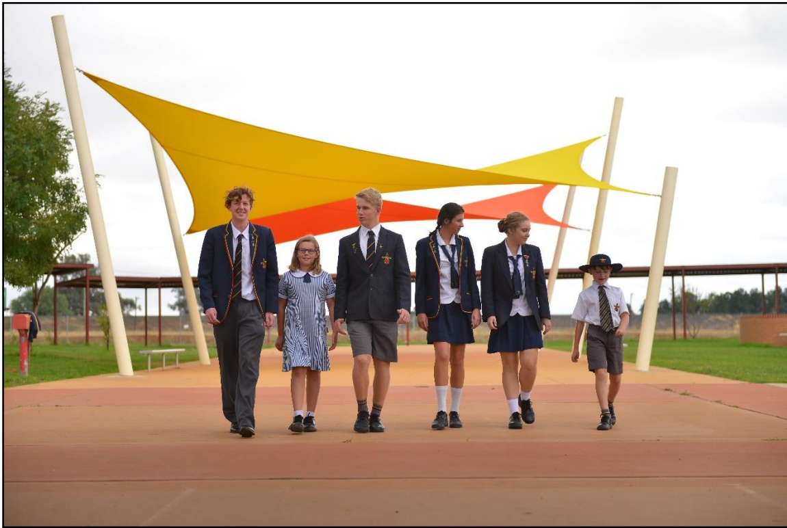
The Macquarie Model 2017 -2021